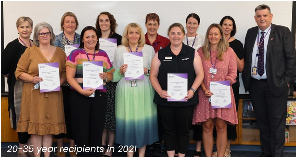
20-35 year recipients in 2021