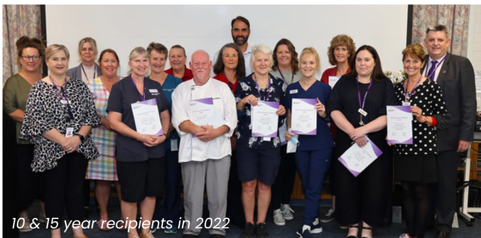
10 & 15 year recipients in 2022