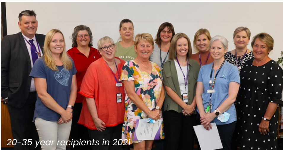
20-35 year recipients in 2021