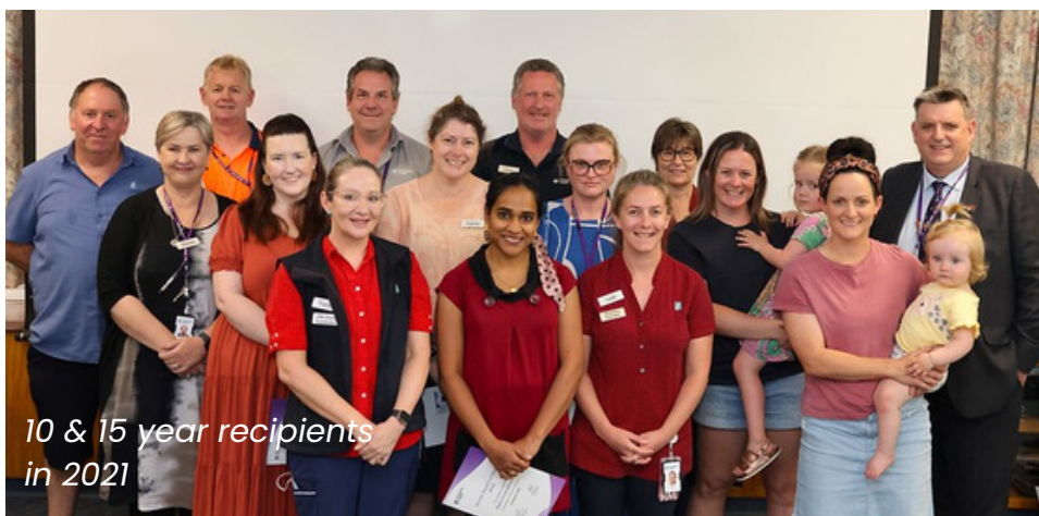
10 & 15 year recipients in 2021